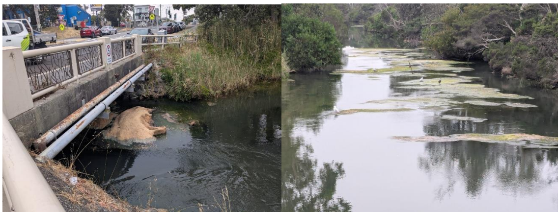
Above -Algae in the creek in Seaford Village at Station Street bridge.