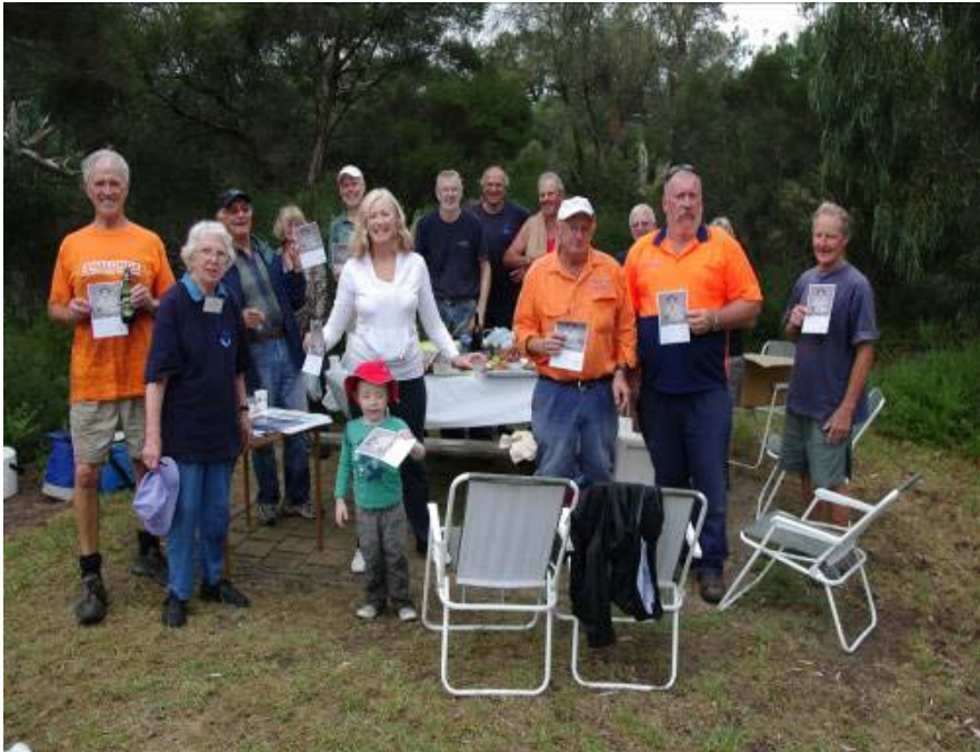
Dedicated KCA Volunteers and Melbourne Water maintenance staff joins forces in March 2010 Clean up Australia Day working bee.