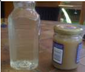
L-R 1. Sediment samples, Beach St drain. 2. Silt flows into the creek at Beach St. 3. Silt bank choking the creek at Beach St.