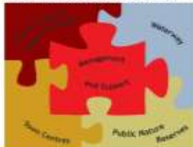
Kananook Creek Corridor Restoration Project

During the last 42 years, the restoration has inspired many to get behind the vision and make it all happen. We are now fully aware that when the four physical pieces are brought and bound cohesively together by management and support we will have created a world class Regional Park which we will all be extremely proud of.